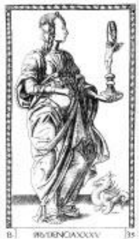
Prudence Mantegna deck

Chariot of Venus," an old mythological and alchemical theme highlighted by the fourteenth century poet Petrarch in his poem I Triumphi. The power of Venus lies in harmony, magnetism and the art of raising consciousness through the power of attraction and pleasure. Left alone. Nature rewards right action with joy and fulfillment, implying