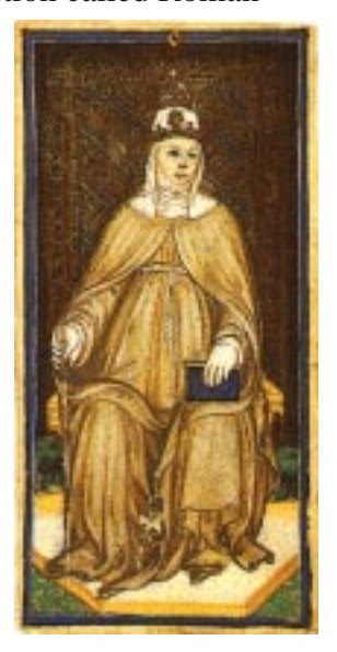
Popess Visconti Sforza deck

Christians (only a small group within the larger Gnostic field) and formal Catholics was in some ways a matter of interpretation of the meaning of a human life, the spiritual forces at work in this world, and the place of the feminine in the panoply of Higher Powers. Suffice it to say that this essay only touches a corner of the extensive mosaic that is Gnosticism.