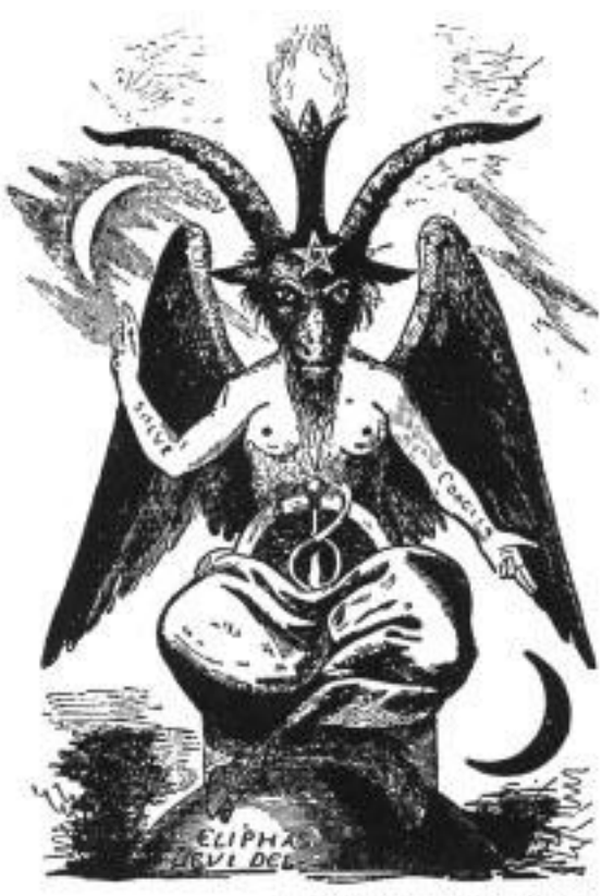
From Levi's Transcendental Magie. BAPHOMET. THE GOAT OF MENDES.

The Tarots that are more optimistically Gnostic emphasize the sensuous breasts and wasp waist, sometimes giving her angel wings rather than bat wings, and referencing her body parts to the elements of Nature (fire in the head, air in the breast, water in the bowels, and earth in the legs). Any Tarot that places a caduceus upon the belly of an obviously female Devil card, whether the caduceus is