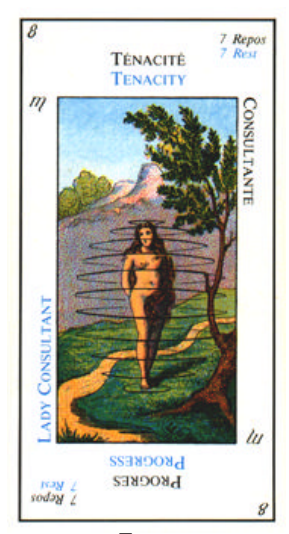
Eve Grimaud Etteila deck

Only in Gnostic thought do we find a positive interpretation of the snake in the